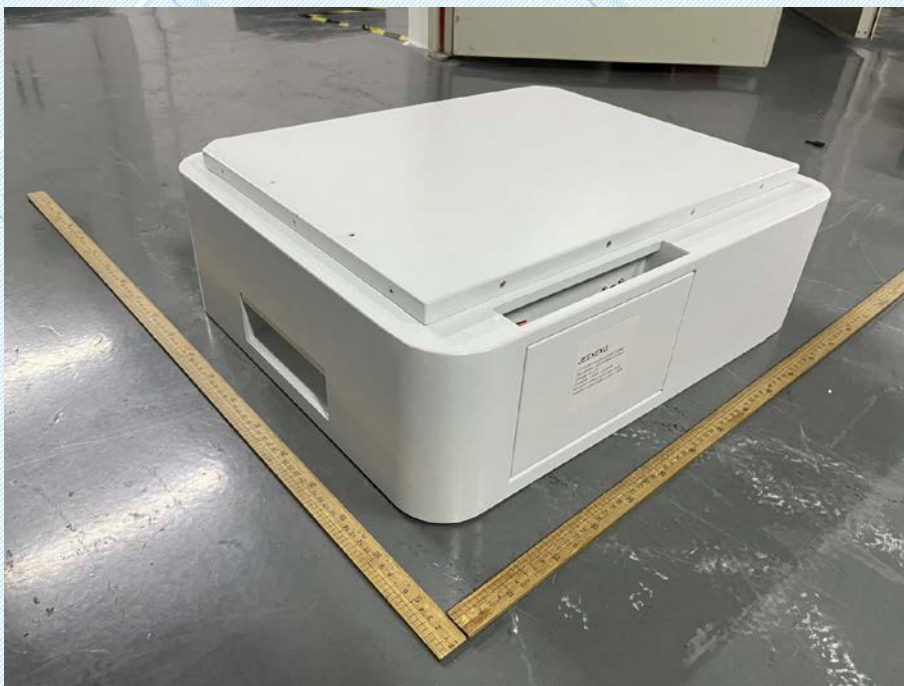
Figure 2 Back view of battery