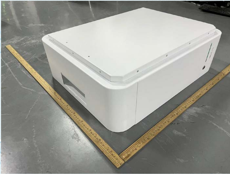
Figure 1 Front view of battery