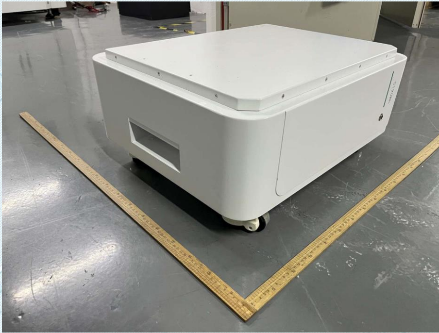
Figure 1 Front view of battery