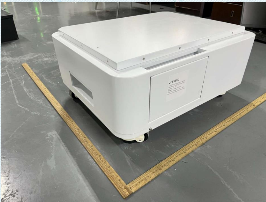
Figure 2 Back view of battery